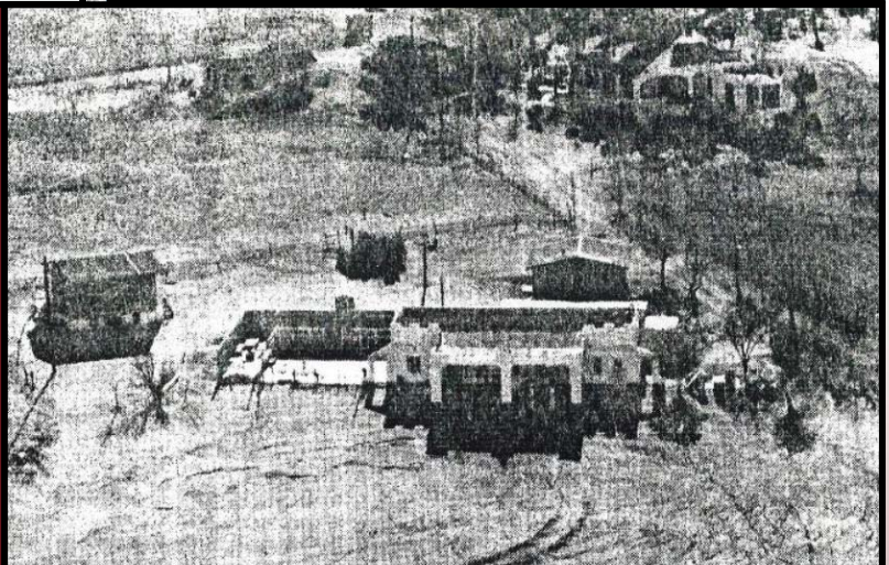
Yucca Inn 1935