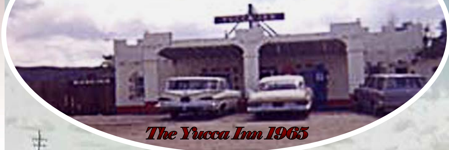
The Yucca Inn 1965