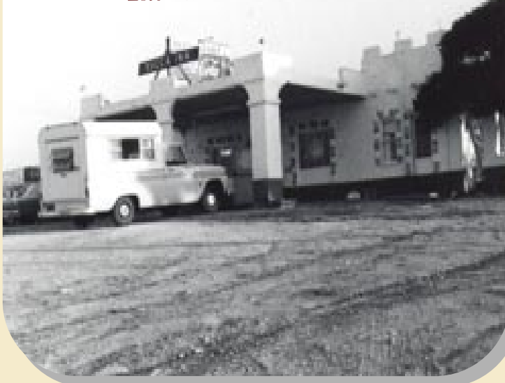
The Yucca Inn 1965

1 Egg .....1.50 4oz Bacon or Sausage.....5.25 Hashbrowns or French Fries.....4.50 Toast or Tortillas.....2.50 Biscuit.....2.75 1 Pancake or French Toast.....3.75 Chicken Fried Steak, Corned Beef Hash, 6oz Chicken Breast, 8oz Angus Patty or 2 Hot Links.....6.75 Ham Steak or 8oz Tri -Tip Steak.....8.00 Cottage Cheese, Slaw, Potato Salad.....4.25 Avocado or Guacamole.....4.50 Rice or Beans.....4.00 1 Taco or Enchilada.....3.75 Onion Rings.....4.75